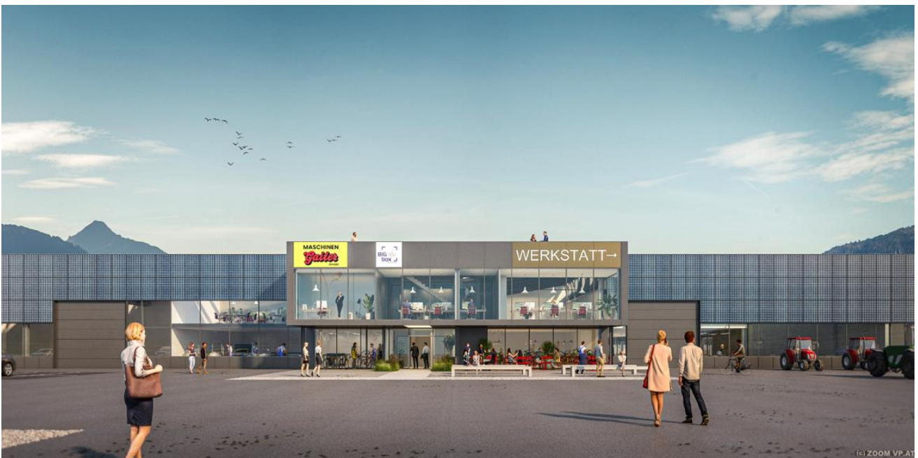
Main entrance view